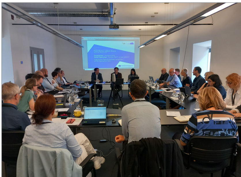
Figure 1: Meeting of the ARCH-E consortium at ZAPS in Ljubljana in 2023.

ARCH-E is a project on architectural design competitions (ADCs) co-funded by the European Union under the Creative Europe framework (CREA). It started in February 2023 and will last for three years. ARCH-e is composed of ten European partner organizations – the Austrian Federal Chamber of Civil Engineers (BKZT), the Architects' Council of Europe (ACE), the Croatian Chamber of Architects (CCA), the Chamber of Architecture and Spatial Planning of Slovenia (ZAPS), the Association of Architects of Cyprus (CAA), the Federal Chamber of German Architects (BAK), Eindhoven University of Technology (TU/e), the Polytechnic University of Valencia (UPV), Sepa Engineering GmbH (SEPA), and the Chamber of Hungarian Architects (MÉK) – with the Chamber of Architecture and Spatial Planning among them, and five cooperation partners: the Czech Chamber of Architects (ČKA), the French National Chamber of Architects (CNOA), the Chamber of Architects of the Province of Bozen, the Swiss Society of Engineers and Architects (SIA), and the International Union of Architects (UIA). ARCH-E recognizes the crucial role of ADCs in the creation of a safe, fair, sustainable, inclusive, and beautiful built environment. Its main objective is to promote high-quality architectural solutions for the built environment by